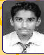
ARYAVART ARYA CHEM (95)