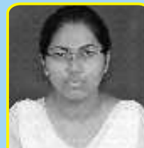
ANJALI 90.4% Science