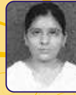
DIVYA CHEM (95)