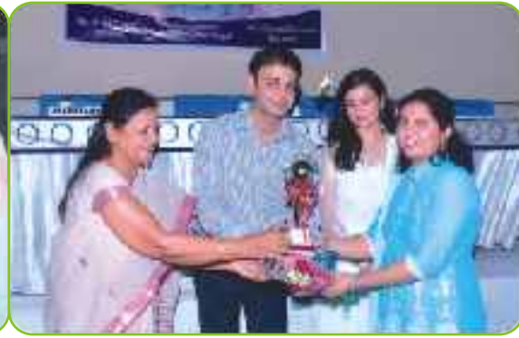
and Rotary Club of Sonapat on 3 and 4 Sept 11 respectively for their meritorious services in the field of education.